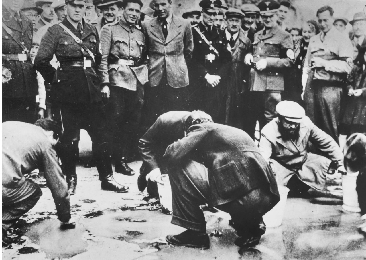
Austrian Nazis forcing Jews to wash the streets. The stripping of these peoples' dignity is looked upon by a staring crowd, which includes the young as well as children.